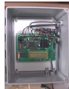
At the Heart of it ALL

The following system configurations have been built and tested successfully or are still in operation. In most cases the mechanical positioners were designed and built by the customer and EEInc implemented the SolarTrak Controller on the system. The basic board is 4"x6".